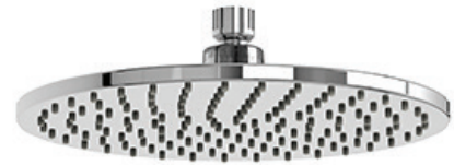
Tête de douche 25 cm (10")